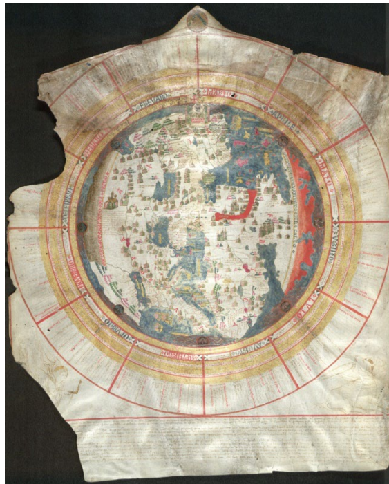
Leardo Mappa mundi 1452

This 4-credit course has 4 hours of group meetings per week (each 50 minute segment of lecture and discussion counts as one hour according to UW-Madison's credit hour policy). The course also carries the expectation that you will spend an average of at least 2 hours outside of class for every hour in the classroom. In other words, in addition to class time, plan to allot an average of at least 8 hours per week for reading, writing, preparing for discussions, and/or studying for quizzes and exams for this class.