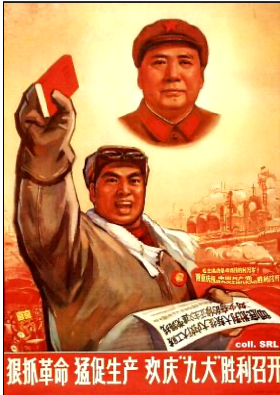
Vigorously seize revolution. Wildly promote production. Welcome the victorious opening of the Ninth Party Congress.