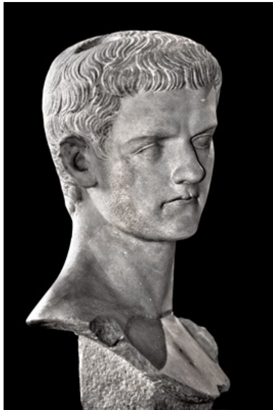
Bust of Caligula Louvre, Paris