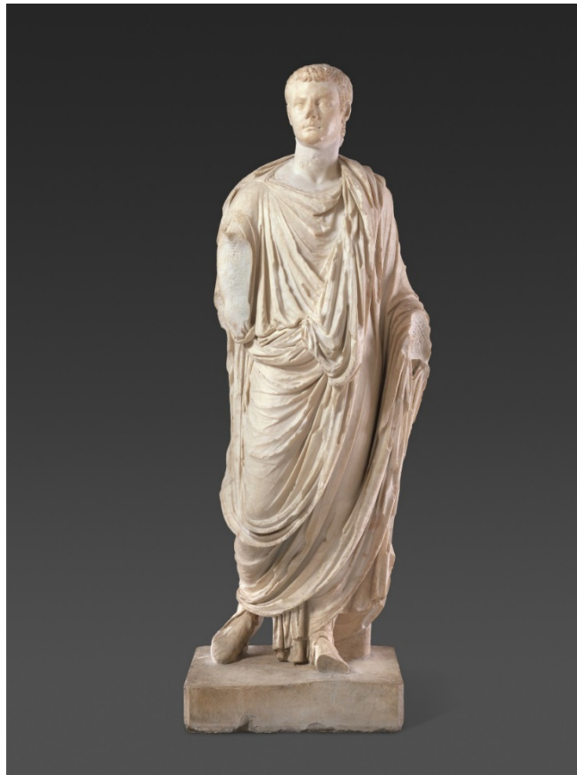
Statue of Caligula Virginia Museum of Fine Arts, Richmond, Virginia Origin: unknown

Submission of Second Assignment: Wednesday 11 March, no later than 4:00 PM.