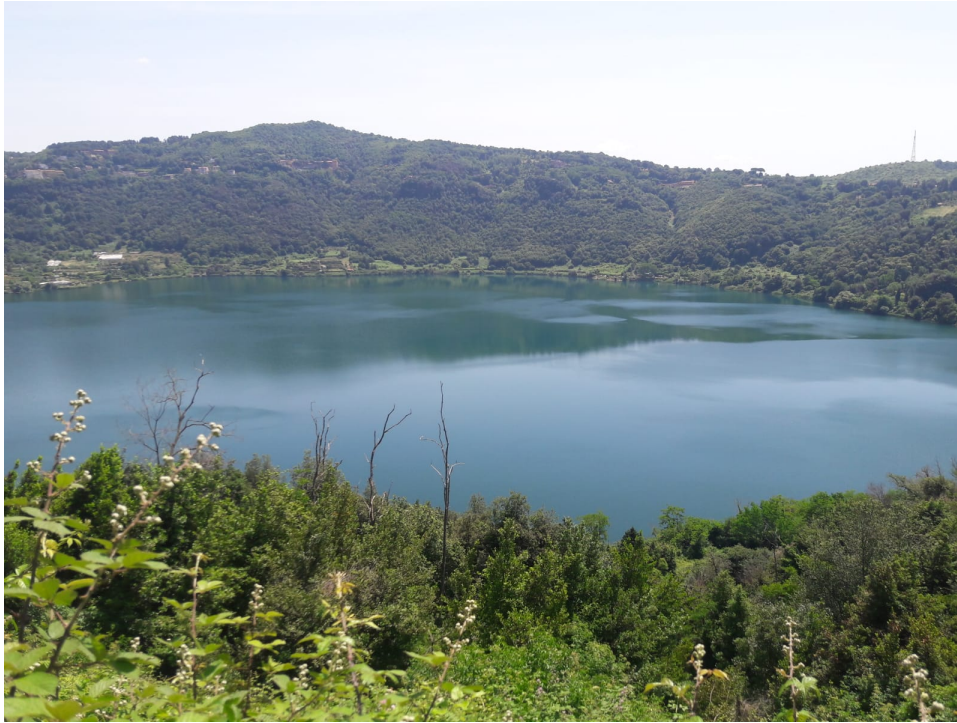
Lago di Nemi; Alban Hills