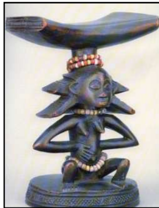
Luba Seat, 18 th c.