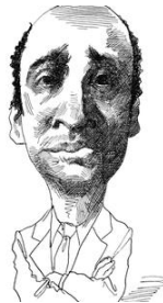
Kwame Anthony Appiah