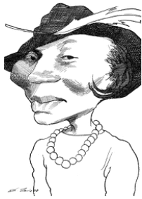
Zora Neale Hurston

Reading for Discussion: H.L. Mencken, “Puritanism as a Literary Force” (1917); Alain Locke, “The New Negro” (1925); Joseph Wood Krutch, selections from The Modern Temper: A Study and a Confession (1929)