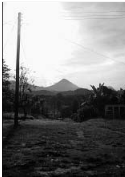
A view of the fair-trade coffee plantation in Montellano, Guatemala.

Fair Trade University hosted a test delegation of students from the UW with the prospect of creating long lasting relationships between UW students and two small fair-trade organic coffee-growing communities in rural Guatemala. While in Guatemala, we spent time in Santa Anita la Union, about an hour and a half outside of Xela, a community with a long-standing relationship to Madison. Santa Anita exports the majority of its coffee to Just Coffee, a 100 percent fair-trade coffee roaster in Madison. The second community, Montellano, is located in the municipality of San Pedro Yepocapa. Both communities shared their histories, struggles, and optimism with us.