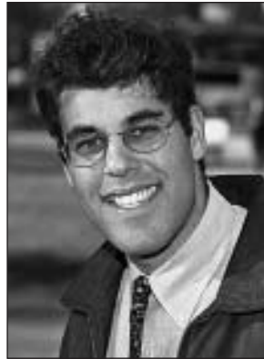
Professor Jeremi Suri

“I will meet Dr. Kissinger whenever he would like,” I responded to his assistant’s inquiry. No playing hard to get for me. We met at his Park Avenue office in New York a month later. There was no small talk. For an hour-and-a-half he grilled me on my research and “how I could know” what I had written. We argued and I lost every point of dispute. “Why am I arguing with the man who negotiated with Mao?” I wondered halfway through this surreal experience. When he was finished, Kissinger dismissed me with the parting words: “You just don’t understand